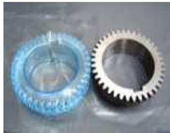
Gear and peeled-out film (AR-1)