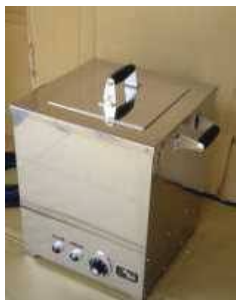
Electric heating bath