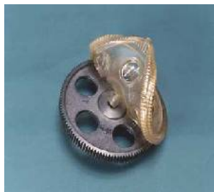
A gear can be easily peeled even after stock of 10 years.

Plastic Coating Compound, Easily Strippable: Used for preventing from corrosion for a long time and protection from damage, as a new method for preservation and packing