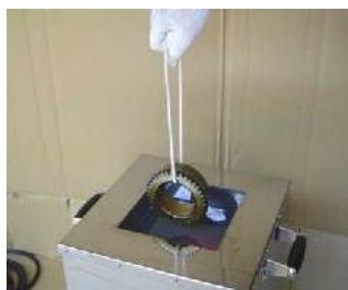
Dipping into the bath