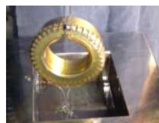
Slowly taking out of the bath