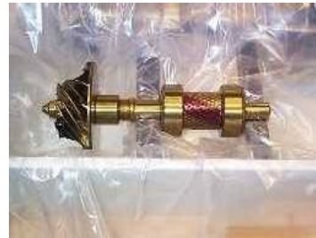
For protection of a large size gear