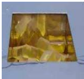
Compound cut into pieces